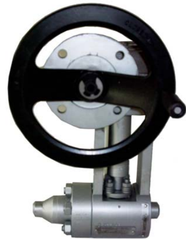
Fig. V1-1 SERIES (Gear)